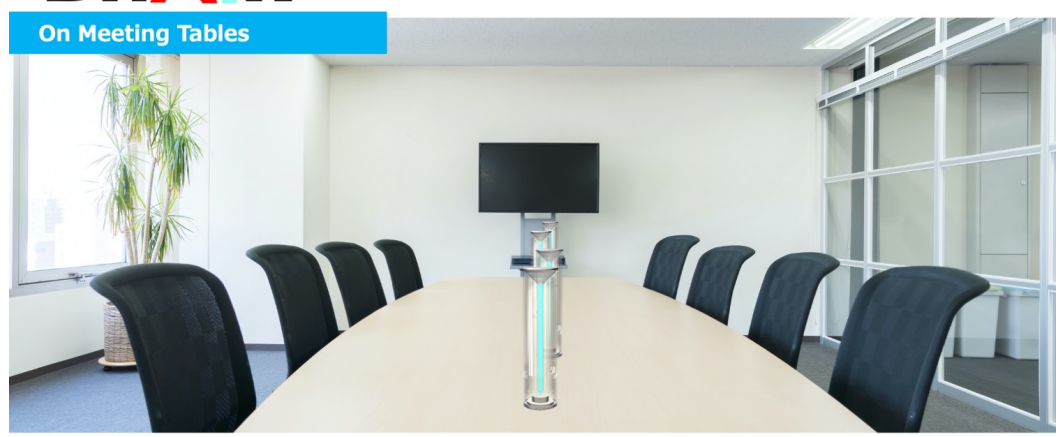
Next Innovation inc.